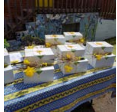
Holiday Gift Baskets! WSCC sold hundreds of Valentine, Spring, Mother's & Father's Day and Fall Harvest Baskets in 2021