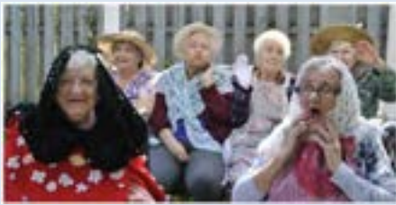
Willow Springs hosted a grand Garden Party at Monty Parks Garden on Sept 10th to celebrate Grandparents' Day in 2017.

WSSC continues to host the Recreation Therapy students from Confederation College at Willow Springs for a session designed to show how accessible art, food and gardening programming fit into a Rec Therapy practice.