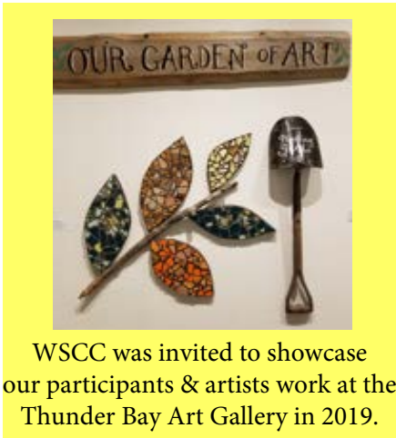
WSSC was invited to showcase our participants & artists work at the Thunder Bay Art Gallery in 2019.

In Sept 2019, our 2nd annual Harry Potter Inspired Festival was an amazing success, grossing over $10,000 and brings over 600 people lots of joy. It is our plan to host our 3rd annual HP Festival this September if COVID allows.